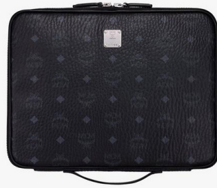
13" IPAD CASE IN VISETOS