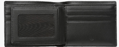
BIFOLD WALLET WITH CARD CASE IN VISETOS