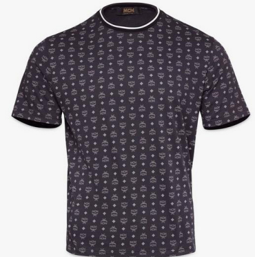
MEN'S VISETOS PRINT T-SHIRT