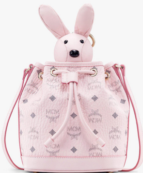
ZOO RABBIT DRAWSTRING BAG