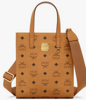
KLASSIK TOTE (MINI)