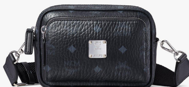
KLASSIK CROSSBODY (X-MINI)