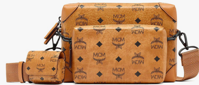
SOFT BERLIN CROSSBODY (SMALL)