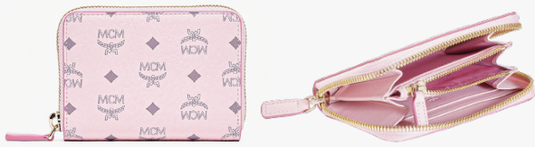
ZIP WALLET IN VISETOS