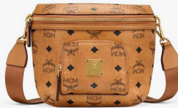
KLASSIK CROSSBODY (SMALL)