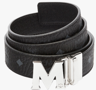
CLAUSE M REVERSIBLE BELT