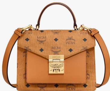
PATRICIA SATCHEL (SMALL)