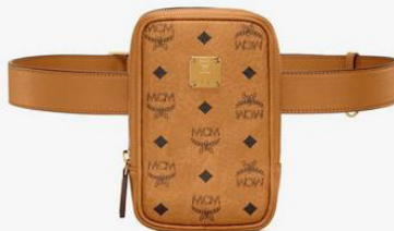
MINI N/S KLASSIK BELT BAG