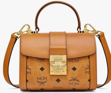
TRACY VISETOS SATCHEL (SMALL)