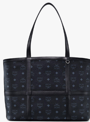
DELMY VISETOS SHOPPER (MEDIUM)