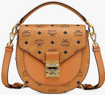
SMALL PATRICIA SHOULDER BAG