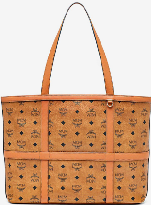
DELMY VISETOS SHOPPER (MEDIUM)