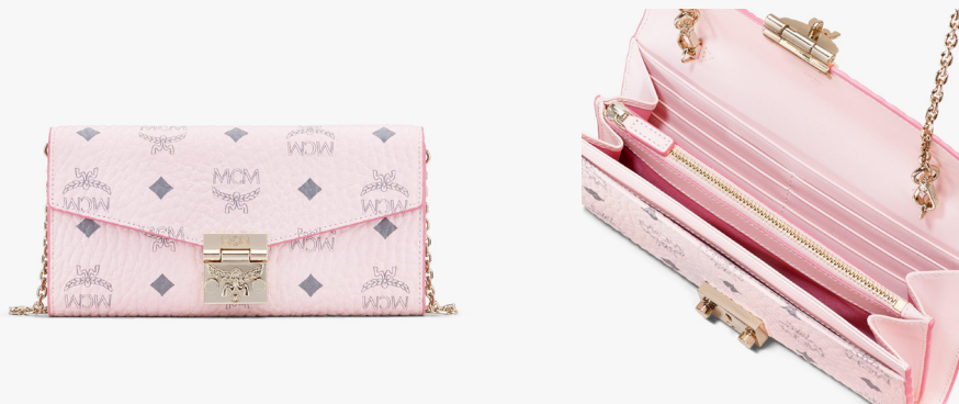
PATRICIA CROSSBODY WALLET IN VISETOS