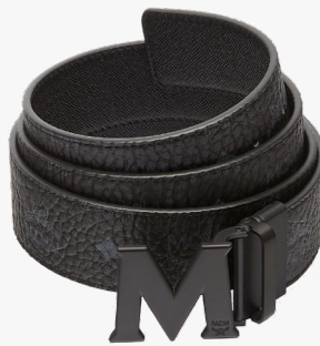
CLAUSE M REVERSIBLE BELT