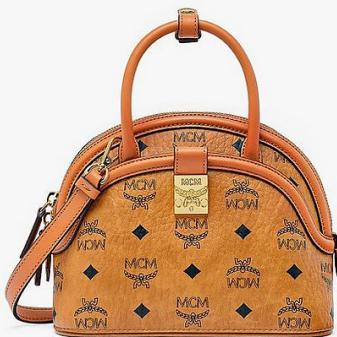
ANNA TOTE (SMALL)