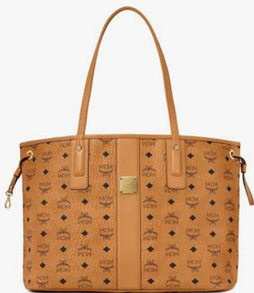
REVERSIBLE LIZ SHOPPER IN VISETOS