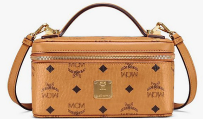
ROCKSTAR VANITY CASE IN VISETOS