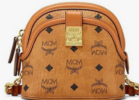
ANNA CROSSBODY (MINI)