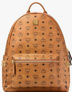
STARK BACKPACK (MEDIUM)