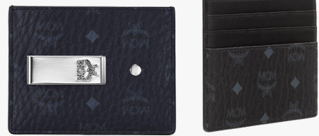
MONEY CLIP CARD CASE