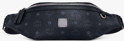
FURSTEN BELT BAG (MEDIUM)