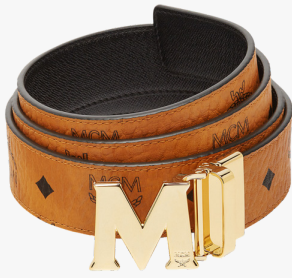
CLAUSE M REVERSIBLE BELT