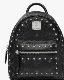
STUDED STARK BACKPACK (X-MINI)