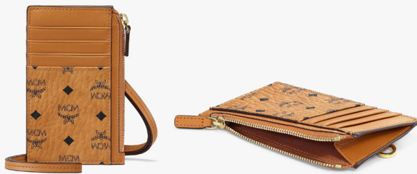
LANYARD CARD HOLDER