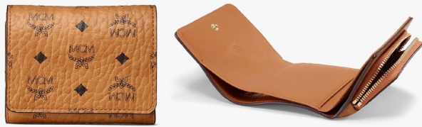
MINI TRIFOLD WALLET