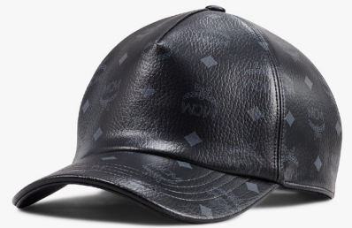
FULL VISETOS CAP