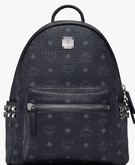
STARK BACKPACK (SMALL)