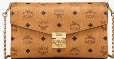
MILLIE CROSSBODY (MEDIUM)