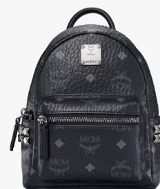
STARK BACKPACK (X-MINI)