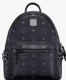
STARK BACKPACK (MINI)