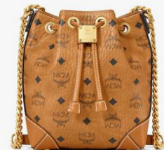
SOFT BERLIN DRAWSTRING (MINI)