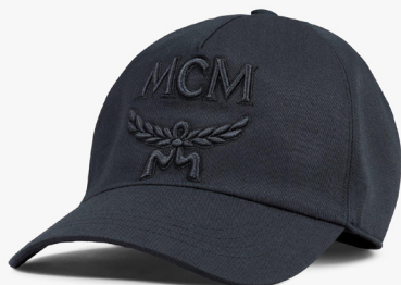
CLASSIC LOGO CAP