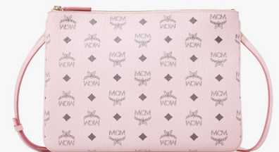
CROSSBODY POUCH (MEDIUM)