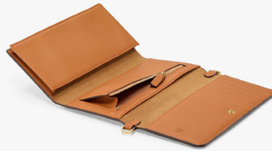
CROSSBODY PHONE WALLET IN VISETOS