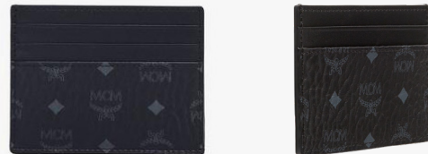
CARD CASE IN VISETOS