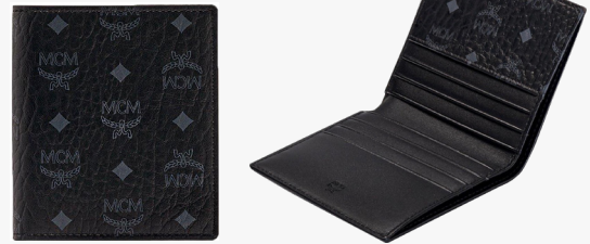
MINI BIFOLD CARD WALLET