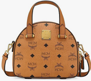
ESSENTIAL HALFMOON TOTE (MINI)