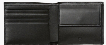
BIFOLD WALLET WITH COIN POCKET IN VISETOS