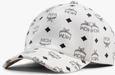
FULL VISETOS CAP