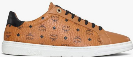
WOMEN'S TERRAIN LO SNEAKERS SIZE 36 THB 13,900