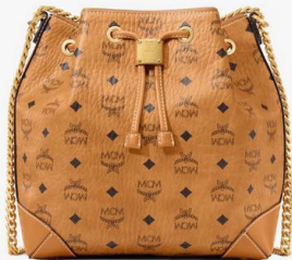
SOFT BERLIN VISETOS DRAWSTRING