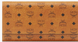
FLAP WALLET IN VISETOS