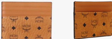
CARD CASE IN VISETOS