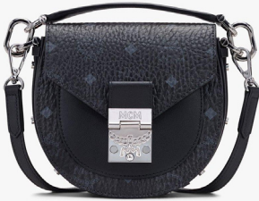
MINI PATRICIA SHOULDER BAG