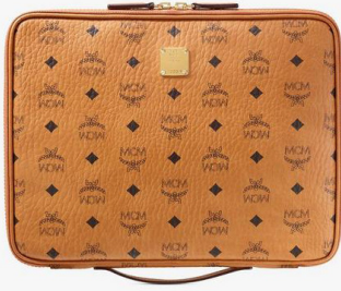
13" IPAD CASE IN VISETOS