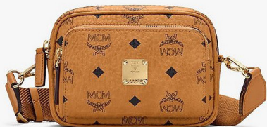
KLASSIK CROSSBODY (X-MINI)