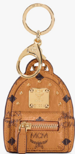
STARK BACKPACK CHARM