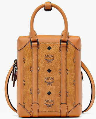
SOFT BERLIN CROSSBODY (SMALL)