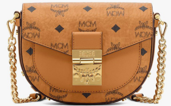
MINI PATRICIA CROSS BODY