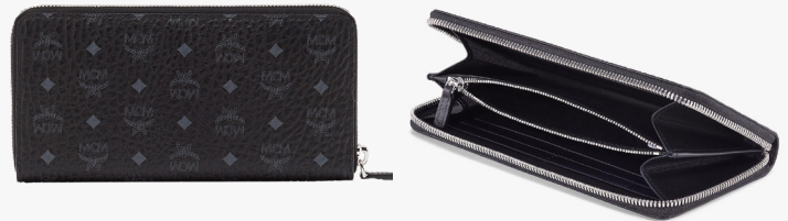
ZIP AROUND WALLET IN VISETOS