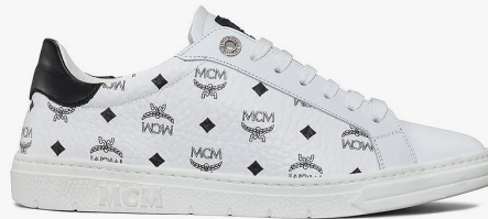
WOMEN'S TERRAIN LO SNEAKERS SIZE 36 THB 13,900