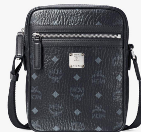
KLASSIK CROSSBODY (MINI)