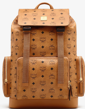
BRANDENBURG BACKPACK (MEDIUM)