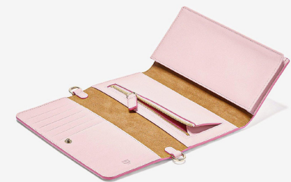
CROSSBODY PHONE WALLET IN VISETOS