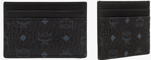
CARD CASE IN VISETOS