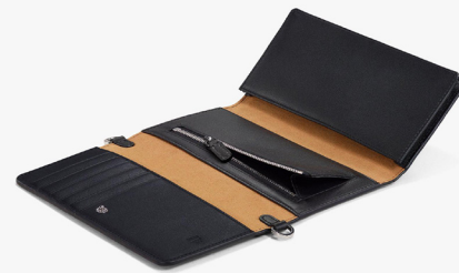
CROSSBODY PHONE WALLET IN VISETOS