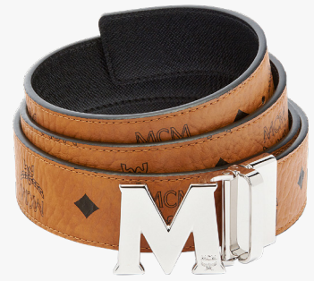
CLAUSE M REVERSIBLE BELT