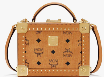
BERLIN CROSS BODY IN VISETOS