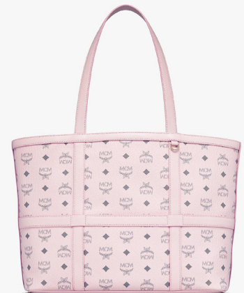
DELMY VISETOS SHOPPER (MEDIUM)