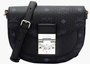
MINI PATRICIA CROSS BODY