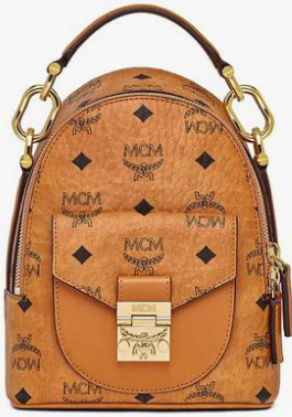
PATRICIA BACKPACK (X-MINI)