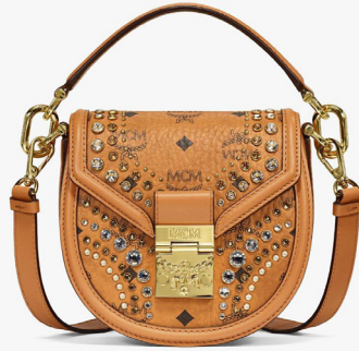
SHOULDER BAG IN CRYSTAL VISETOS