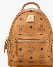
STARK BACKPACK (X-MINI)