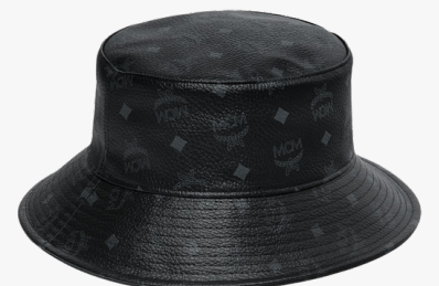
BUCKET HAT IN VISETOS