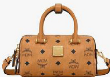
ESSENTIAL BOSTON (MINI)