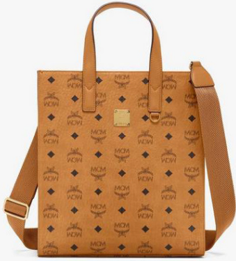
KLASSIK TOTE (SMALL)