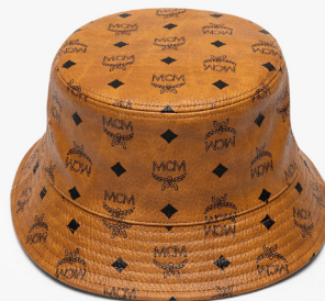
BUCKET HAT IN VISETOS