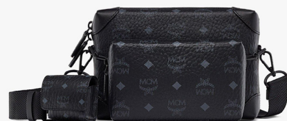
SOFT BERLIN CROSSBODY (SMALL)