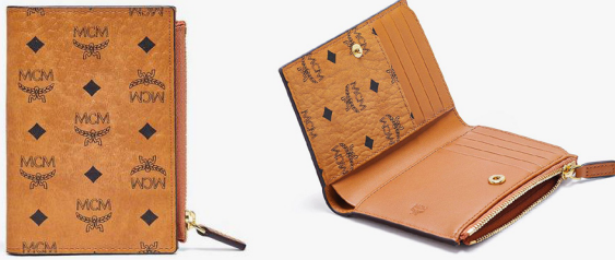
BIFOLD ZIP CARD WALLET IN VISETOS