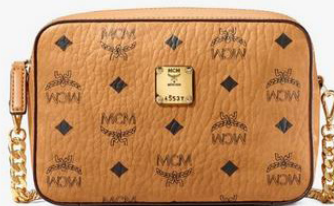
CAMERA BAG CROSSBODY (MINI)