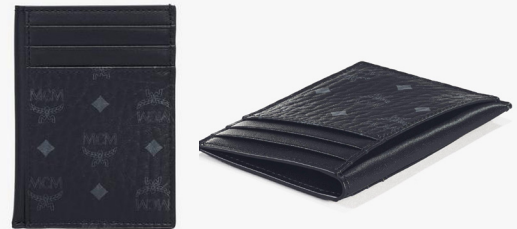
N/S CARD CASE IN VISETOS