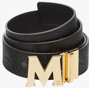
CLAUSE M REVERSIBLE BELT