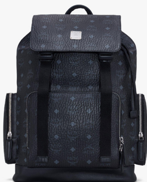
BRANDENBURG BACKPACK (MEDIUM)