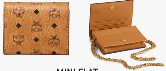
MINI FLAT WALLET