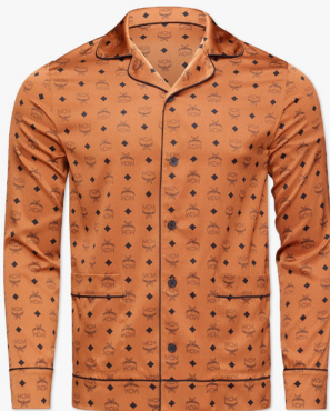
CLASSIC LOGO SILK PAJAMA SHIRT