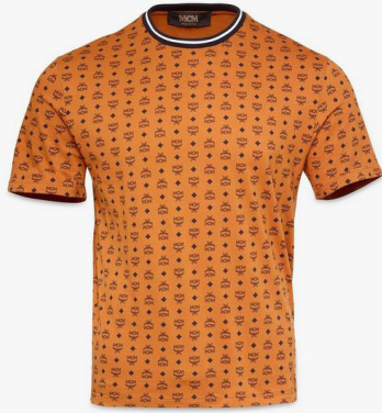
MEN'S VISETOS PRINT T-SHIRT