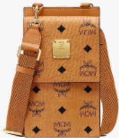
CROSSBODY PHONE CASE