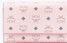
TRIFOLD WALLET IN VISETOS