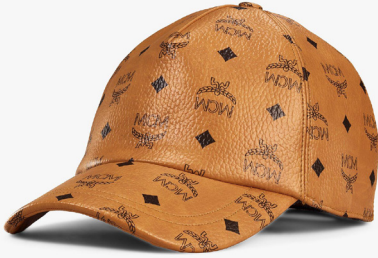
FULL VISETOS CAP