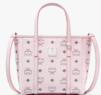
TONI SHOPPER (MINI)