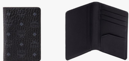
MINI TWO FOLD WALLET IN VISETOS