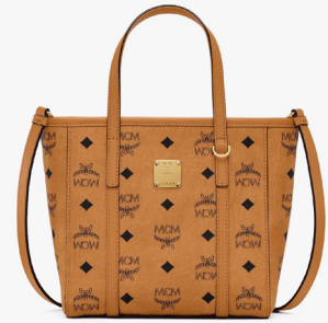
TONI SHOPPER (MINI)