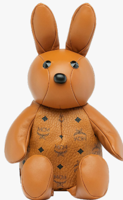
MCM ZOO RABBIT DOLL BACKPACK