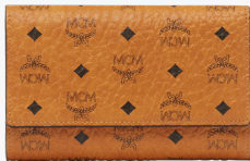
TRIFOLD WALLET IN VISETOS