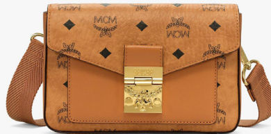
MILLIE CROSSBODY (SMALL)