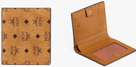
FLAT WALLET IN VISETOS