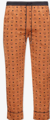
CLASSIC LOGO SILK PAJAMA PANTS