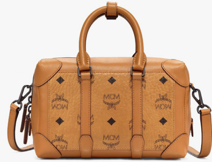
SOFT BERLIN CROSSBODY (SMALL)