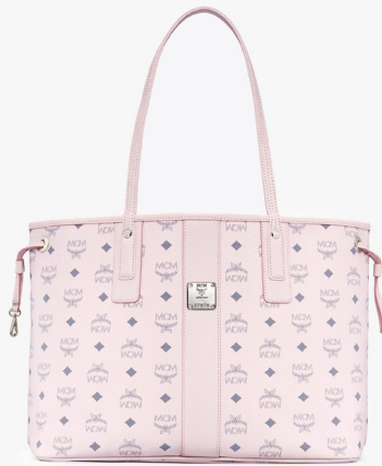
REVERSIBLE LIZ SHOPPER IN VISETOS