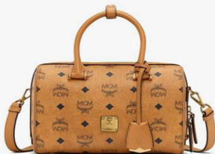
ESSENTIAL BOSTON IN VISETOS