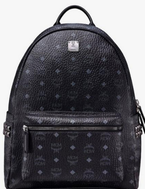
STARK BACKPACK (MEDIUM)