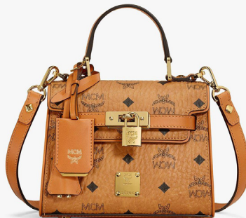
HERITAGE SATCHEL (MINI)