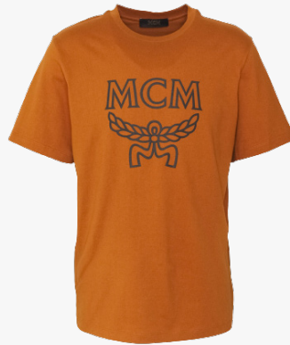
MCM COLLECTION SHORT SLEEVES T-SHIRT