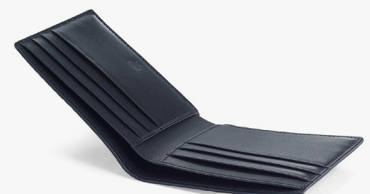
BIFOLD WALLET IN VISETOS