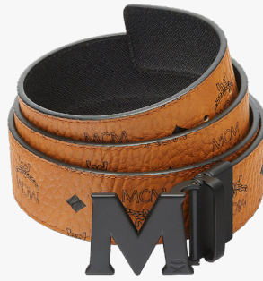
CLAUSE M REVERSIBLE BELT