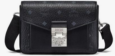
MILLIE CROSSBODY (SMALL)