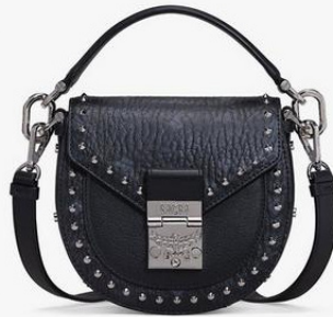
MINI PATRICIA SHOULDER BAG IN STUDED OUTLINE